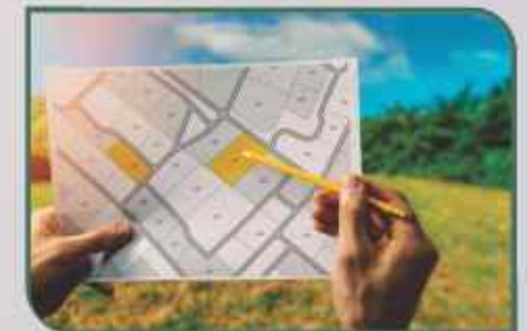
Each Plot Demarcation