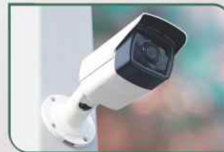
CCTV Surveillance System