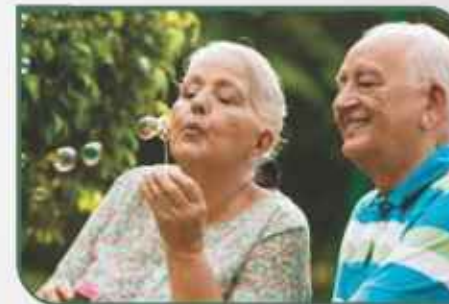
Senior Citizen Park